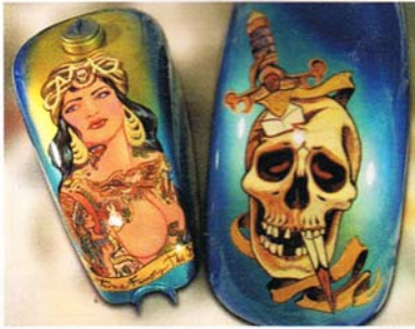
Fortune Favors The Bold on "Fortune Teller."