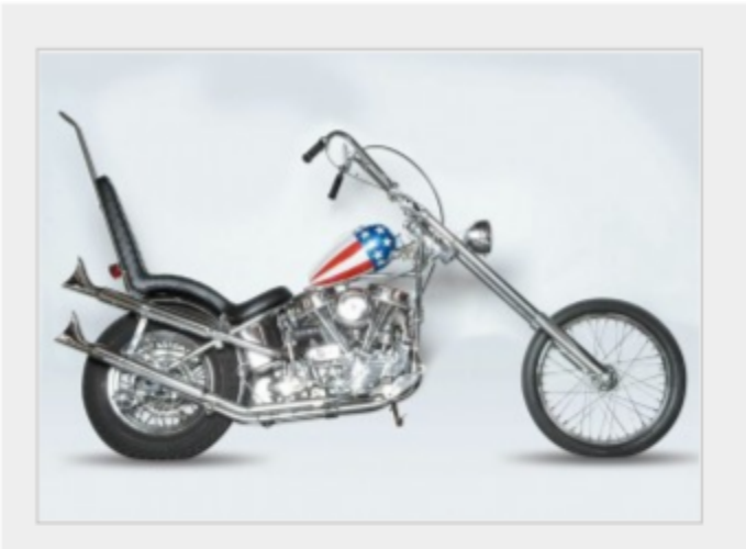
Captain America

Now celebrating its 28th consecutive year as "The Best Party Anywhere," The Legendary Buffalo Chip is the Sturgis Rally's best-known hot spot. Since 1982, the Chip has become internationally famous for the performances on its 4 stages, hotbartenders and special events presented "by bikers, for bikers." The Legendary Buffalo Chip has been featured on one 13-episode television series and five television specials, some of which remain in current broadcast rotation. Its 2009 schedule of events includes its 9-day concert series (free to campers) featuring favorites like Aerosmith, Toby Keith, Cheech and Chong, Hinder, Tesla, George Thorogood and Creedence Clearwater Revisited.