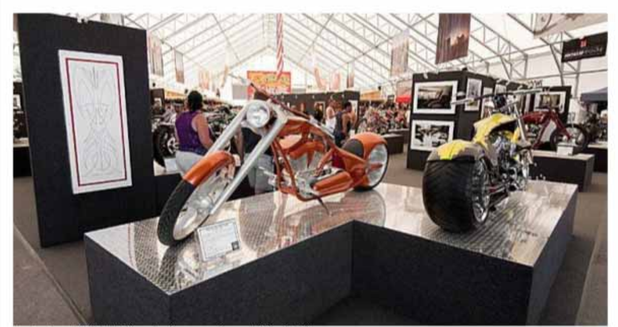
Last year's exhibit at the Thunder Dome was themed "Stay Gold"

Lichter haschronicled the Sturgis Rally through hisphotography since 1979, and hassewed as curator of the "MotorcyclesAsArt" exhibition since its inception in 2001.