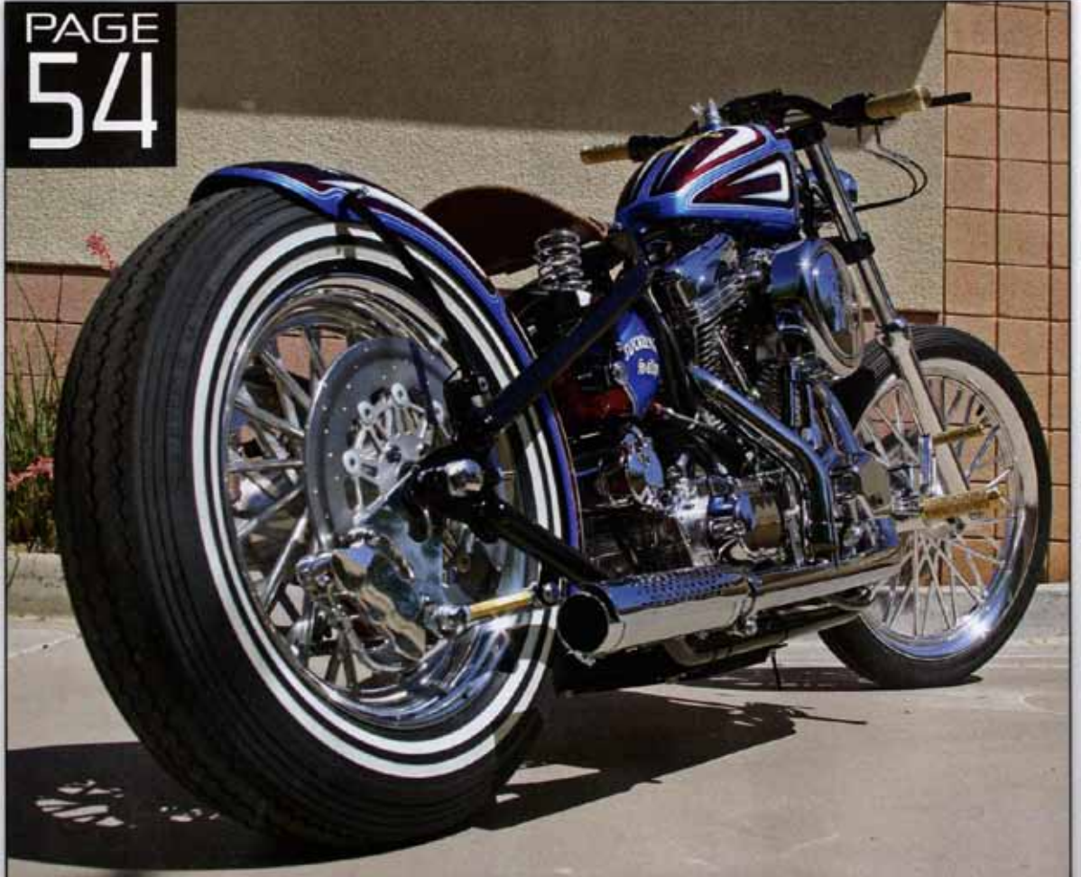
THE CONSPIRACY MACHINE